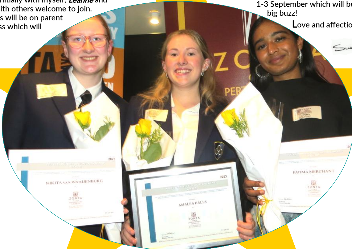
OUR THREE YWPA AWARD FINALISTS