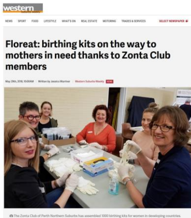
© The Zonta Club of Perth Northern Suburbs has assembled 1000 birthing kits for women in developing countries.

ONE THOUSAND birthing kits are on their way to mothers in developing countries, thanks to Zonta Club members, friends and supporters who gathered in Floreat on the weekend.