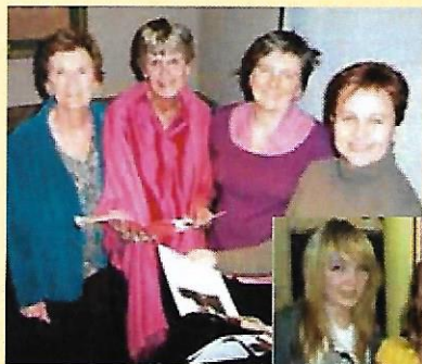
Public Seminar on Human Trafficking