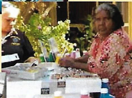
Aboriginal Arts & Crafts Project