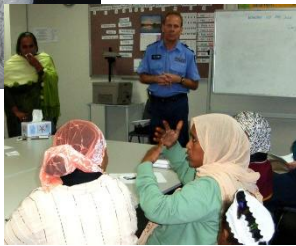
Right: Question time