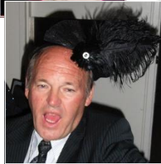
oops, that's no filly!