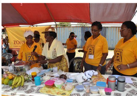
No trouble working out who's running this fundraiser!