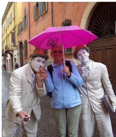
Promoting Zonta in Mantua, Italy