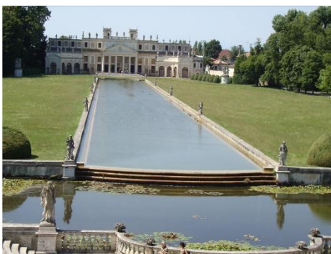
Pisani Villa once owned by Napoleon

We'll look forward to catching up in person again Susan—we've missed your bubbly personality over these past couple of months. (Ed.)