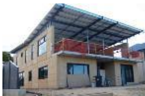
Sept 2010 The roof went on ....

The house that 'A' built is going well as you can see from the following.