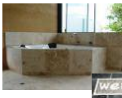
Just a little taste of the inside—can't give away too many details before the house warming!!