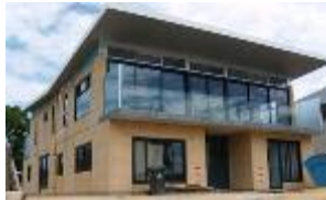
January 2011 Not many changes to the outside, but lots happening inside...