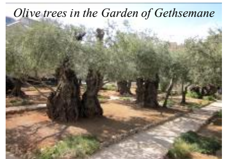
Olive trees in the Garden of Gethsemane

Also not to be forgotten was the 'Rose Red City of Petra' in Jordan. From 200 BC to 200 AD it was on the big trading routes, until the Romans built the ten cities of the Decapolis, taking all the trade away. This wonderful city carved out of rock is one of the Wonders of the World.