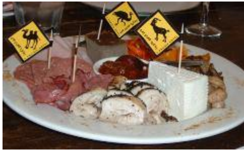
Lake Eyre Yacht Club, Marree